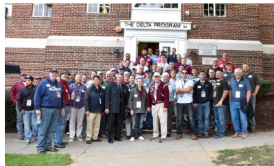
Seven decades of players attended

It was a night for the ages Friday, Sept. 16, as the State College Area School District hosted the first Annual Football Alumni evening at the Little Lions' home opener.