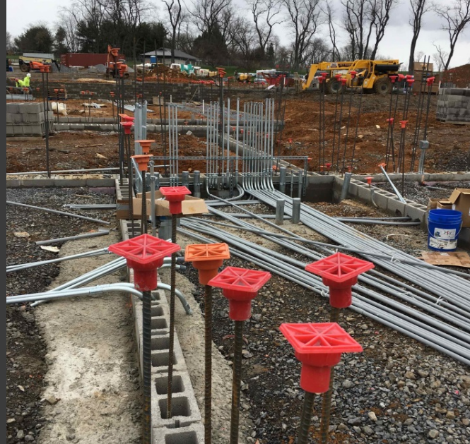
Farfield EC installed conduit rough-ins at the Unit D electrical room