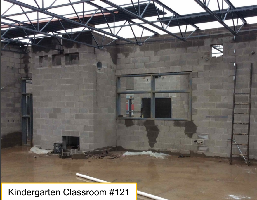
Kindergarten Classroom #121

Lobar installed the roof joists and metal decking in Unit A.