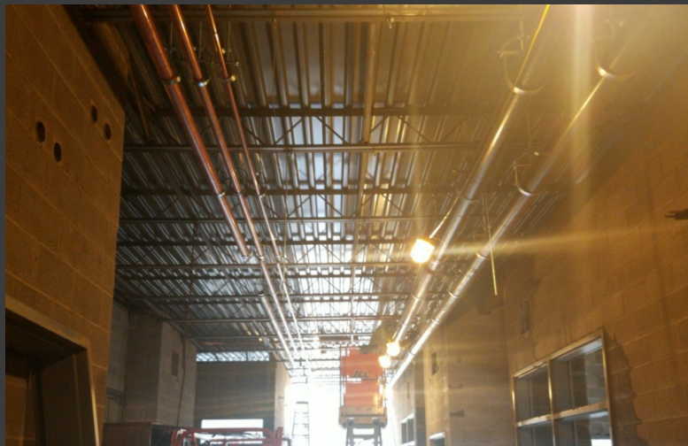
Water loop piping and plumbing lines in Unit A corridor