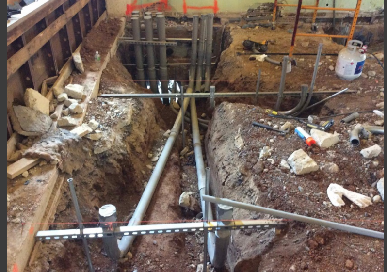
The Farfield Company installing underground conduit into Main Mechanical Room (Existing Unit A)