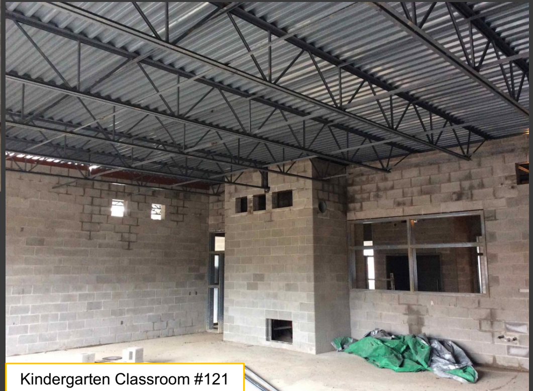
Kindergarten Classroom #121

Lobar installed the roof joists and metal decking in Unit A.