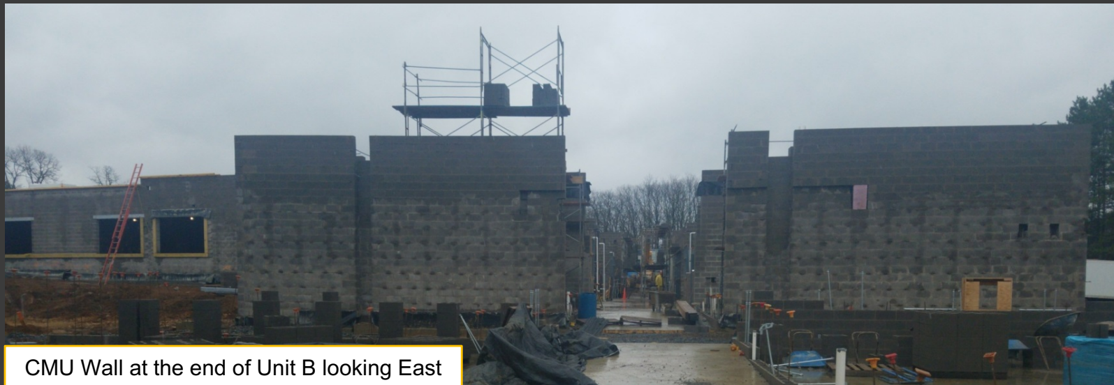
CMU Wall at the end of Unit B looking East