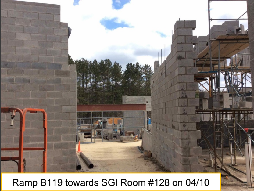
Ramp B119 towards SGI Room #128 on 04/10