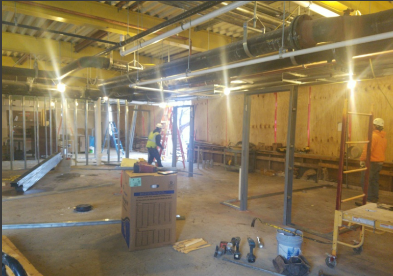
Door frames installed ahead of wall placement