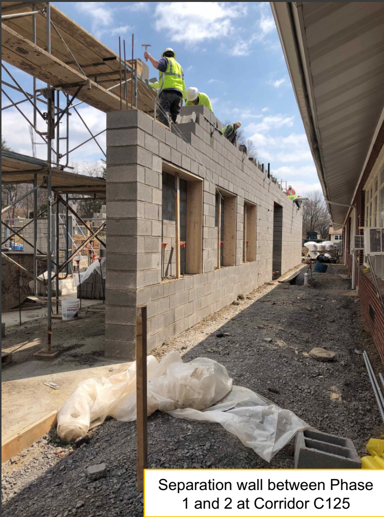
Separation wall between Phase 1 and 2 at Corridor C125

Lobar subcontractor is placing the interior CMU walls of Unit C starting at the South end of Phase 1.