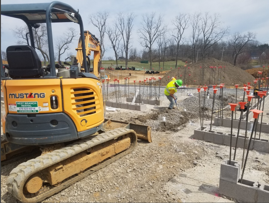
LTS Plumbing installed the underground sanitary line in the Unit D corridor