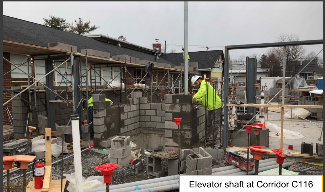
Elevator shaft at Corridor C116