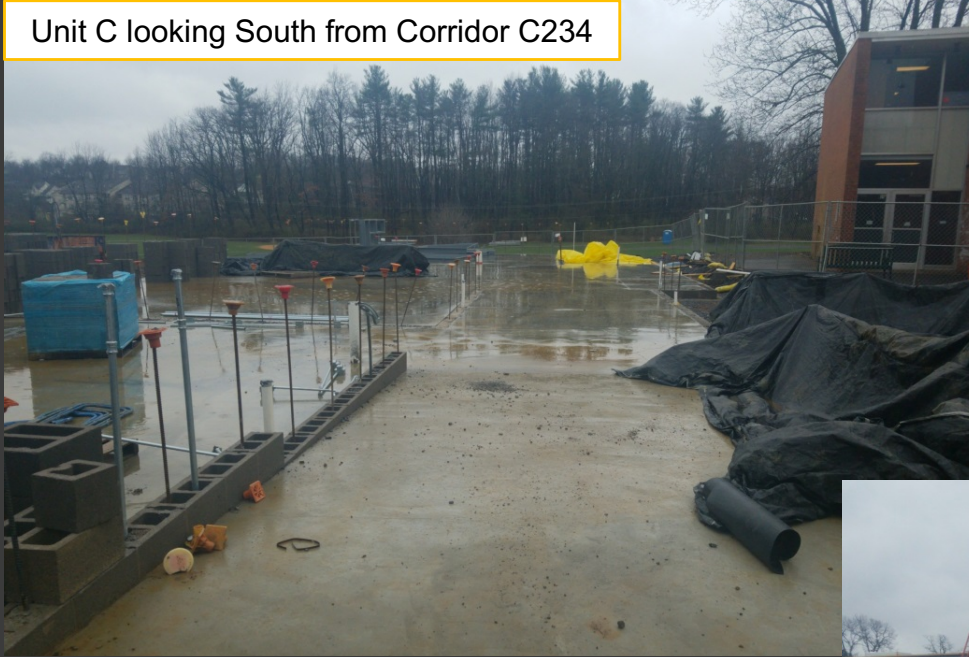
Unit C looking South from Corridor C234

Unit C slab on grades placed at South corner between Unit B and existing school