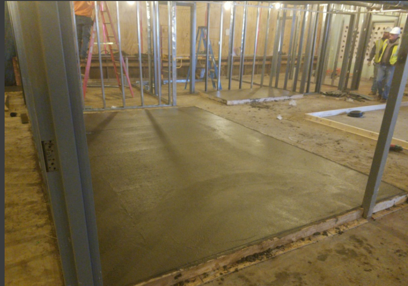
Concrete pads placed for the mechanical equipment