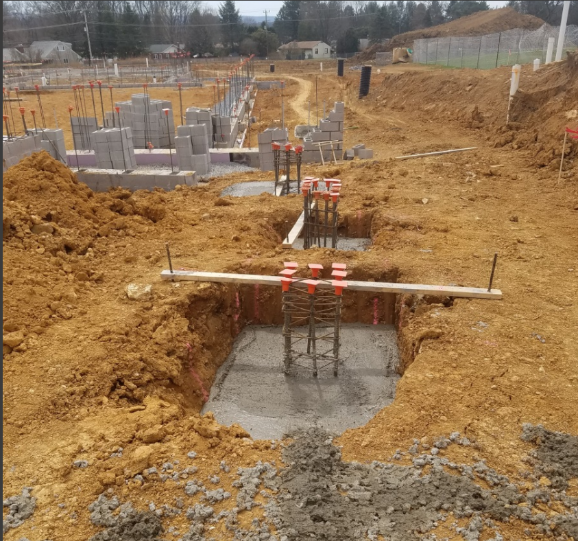
Lobar placed the concrete piers for the main entrance canopy in Unit A on 04/13.