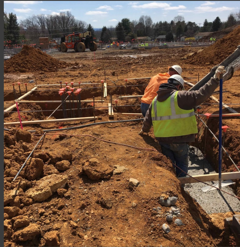
Lobar placed the concrete footers at the West side of Unit A on 04/18.