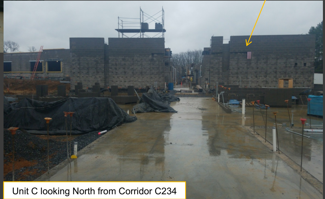
Unit C looking North from Corridor C234