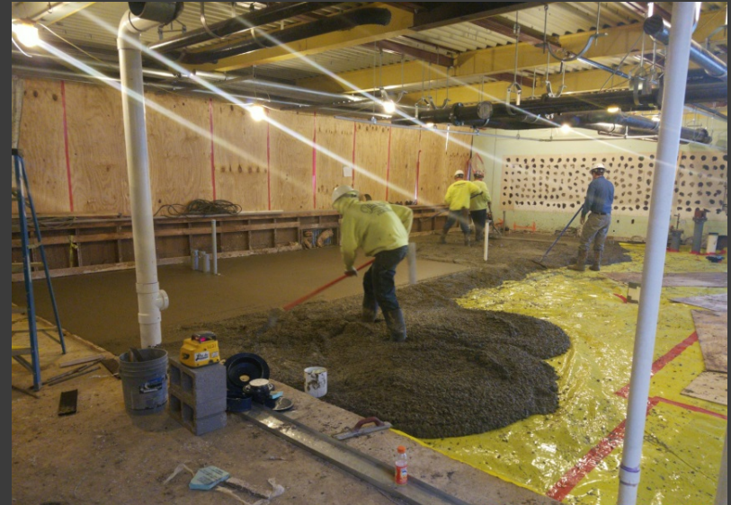
Concrete slab on grade placed on 04/12