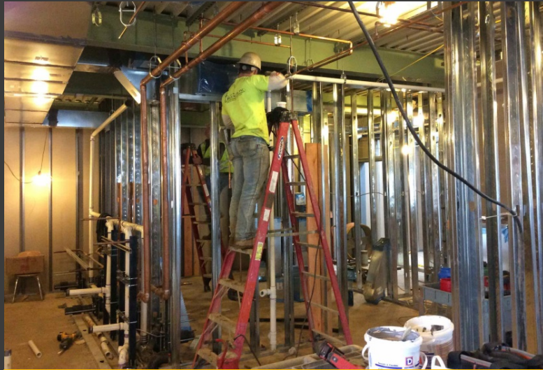
Reynolds installing water lines in Existing Unit A