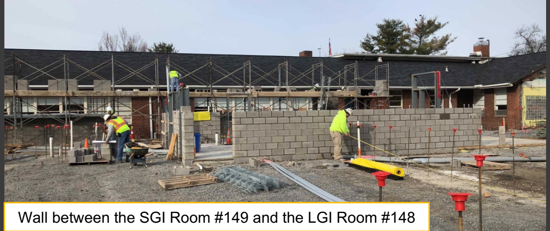
Wall between the SGI Room #149 and the LGI Room #148

Lobar subcontractor is placing the interior CMU walls of Unit C starting at the South end of Phase 1.