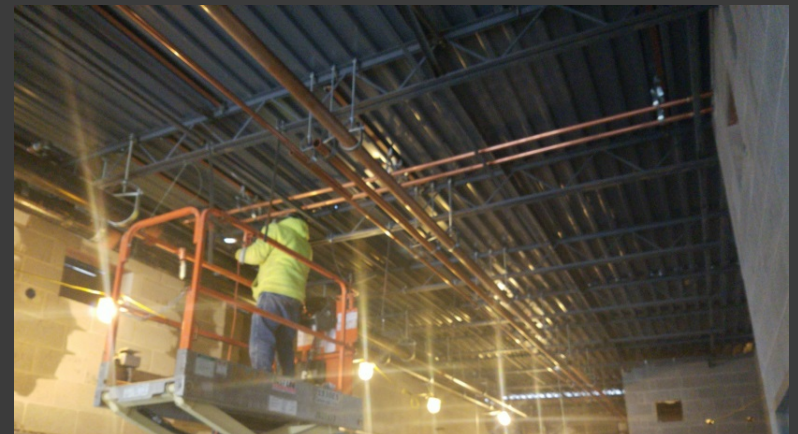
Silvertip installing water loop piping in Unit A corridor