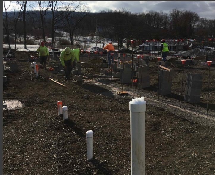
Lobar subcontractor installed interior foundation walls along the corridor in Unit D