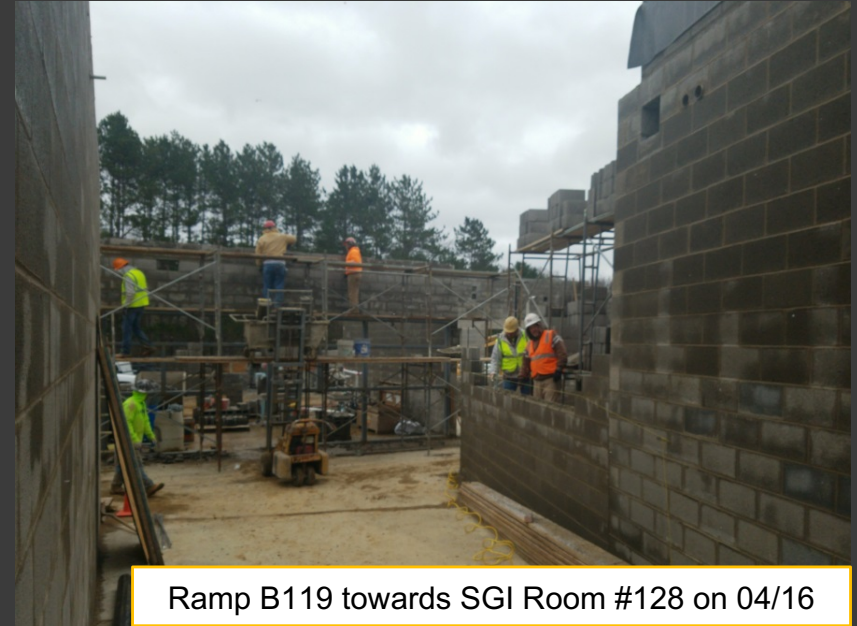
Ramp B119 towards SGI Room #128 on 04/16